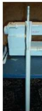
Insert Dowel until completely turned