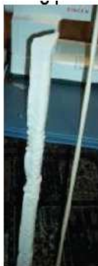
Hug over PVC