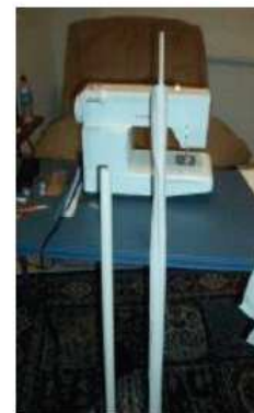
Remove Dowel & "turned" Hug.

Leave dowel in hug and use it to pop out the corners.